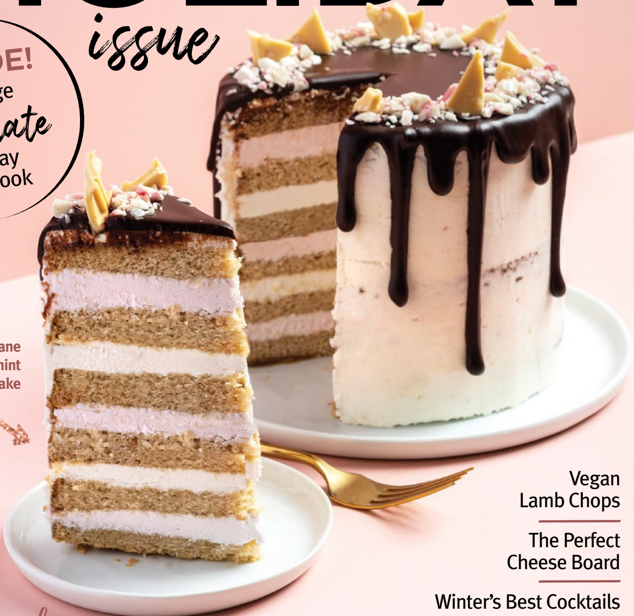
Candy Cane Peppermint Vanilla Cake

INSIDE! 16-page Ultimate Holiday Cookbook