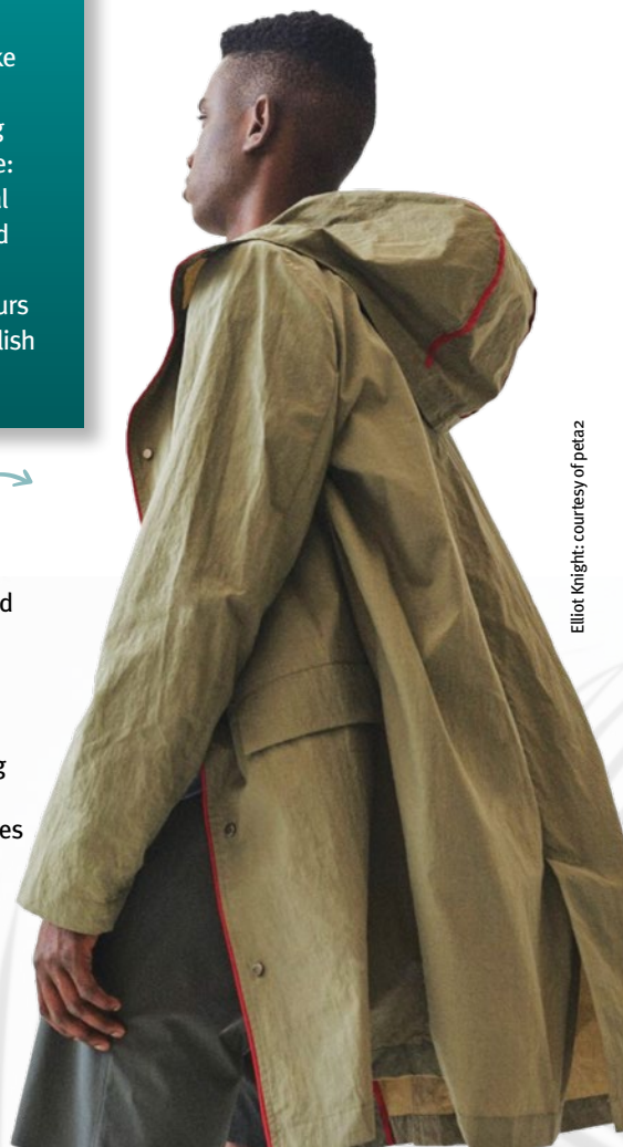
Elliot Knight: courtesy of petaz

Finally, someone is pulling plastic from the waste stream and transforming it into something useful. This light trench by Ecoalf was reborn from recycled fishing nets, and boasts rain-repelling qualities to keep you dry and dapper. $275